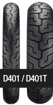
D401 / D401T